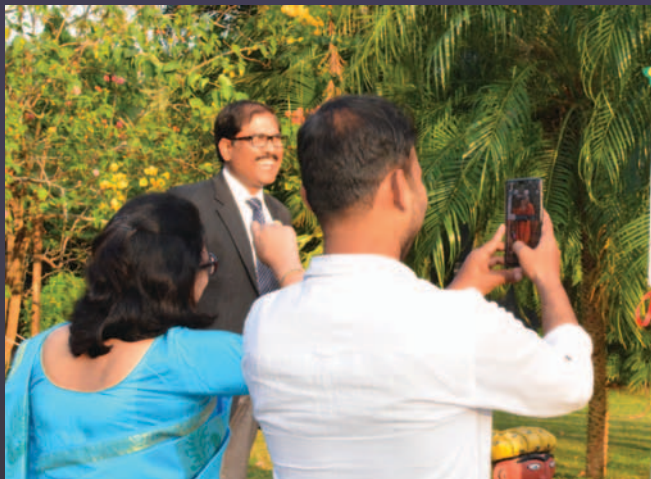
Prof. (Dr.) Prasanna Kumar Patasani, Hon'ble Member of Parliament (Lok Sabha) at the Selfie Point during the Ignite-2018