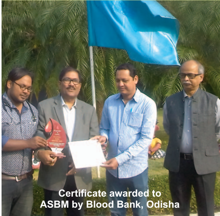
Certificate awarded to ASBM by Blood Bank, Odisha