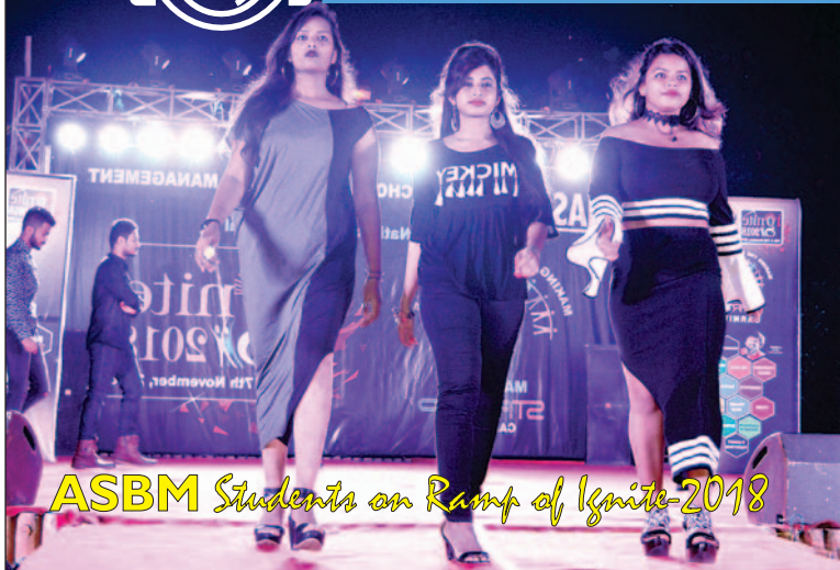
ASBM Students on Ramp of Ignite-2018