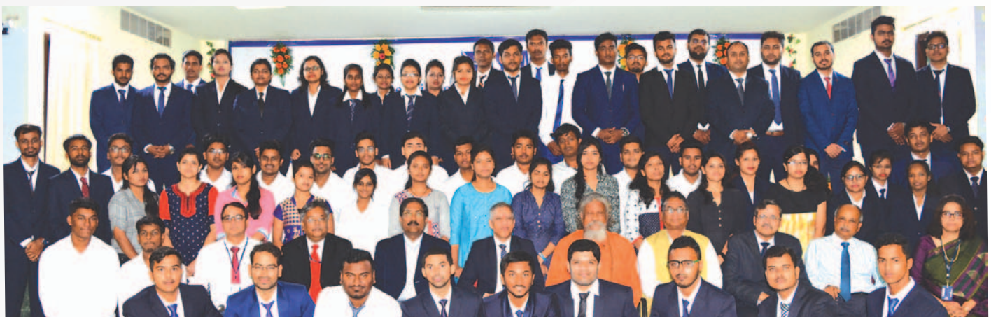
New Batch 2018