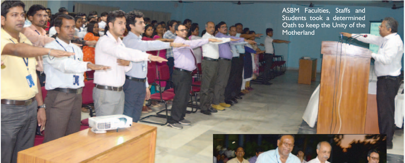
ASBM Faculties, Staffs and Students took a determined Oath to keep the Unity of the Motherland